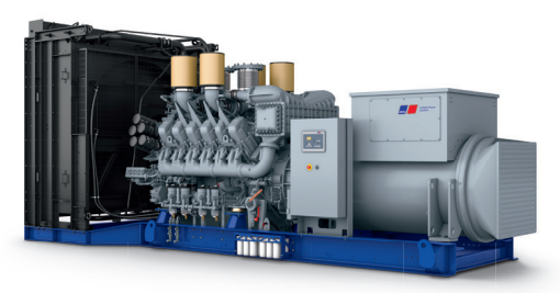
Optional equipment and finishing shown. Standard may vary.

380V – 11 kV/50 Hz/prime power for stationary emergency/ fuel consumption optimized/12V4000G14F/water charge air cooling